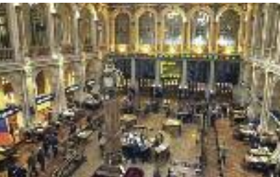
Bolsa de Madrid (stock exchange)