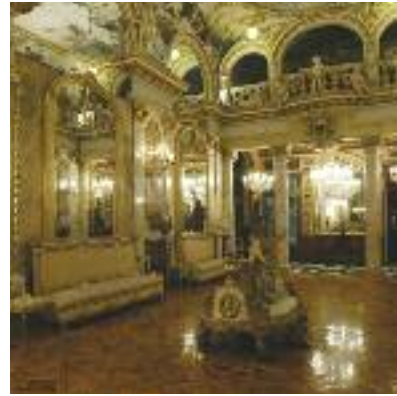
Inside of Museo Cerralbo