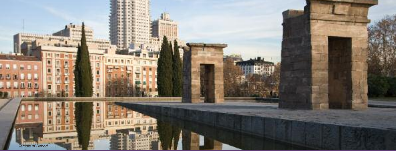
Temple of Debod