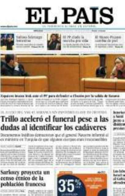
El Pais Newspaper