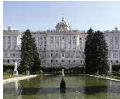
Outside of Palacio Real