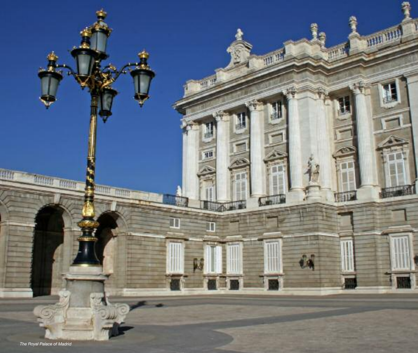
The Royal Palace of Madrid