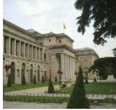
Outside Museo del Prado