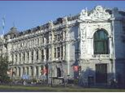
Banco de España